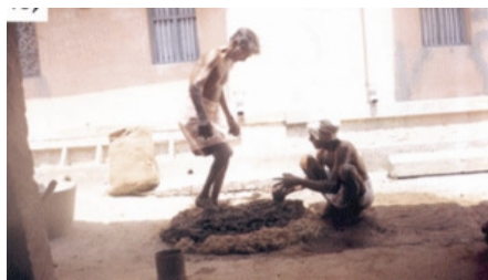
Puddling the mix