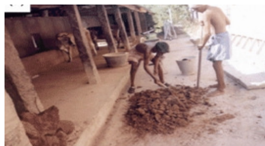
Powdering the soil