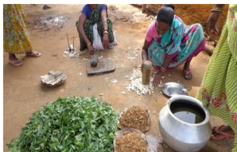
Seeds are treated with using botanicals