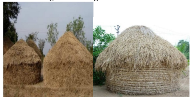
On ground storage structures