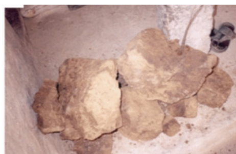
Tank bed silt