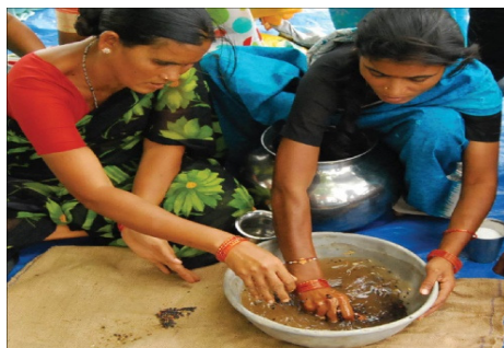
Seeds are treated with cow urine