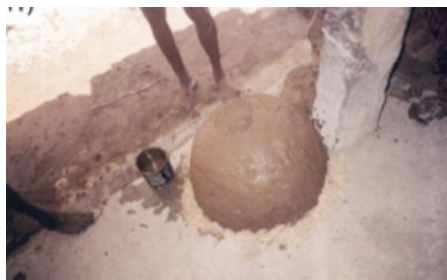
Final stage of poultice