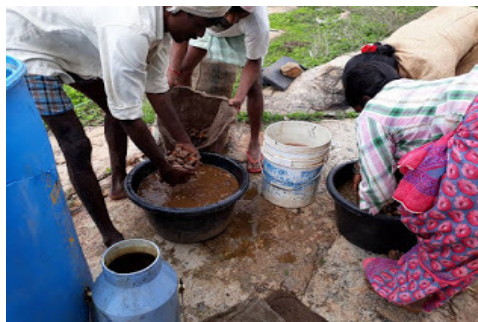
Seeds are treated with cow dung